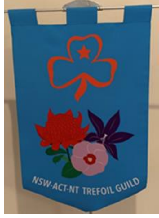
Have a look at our new State Banner !!