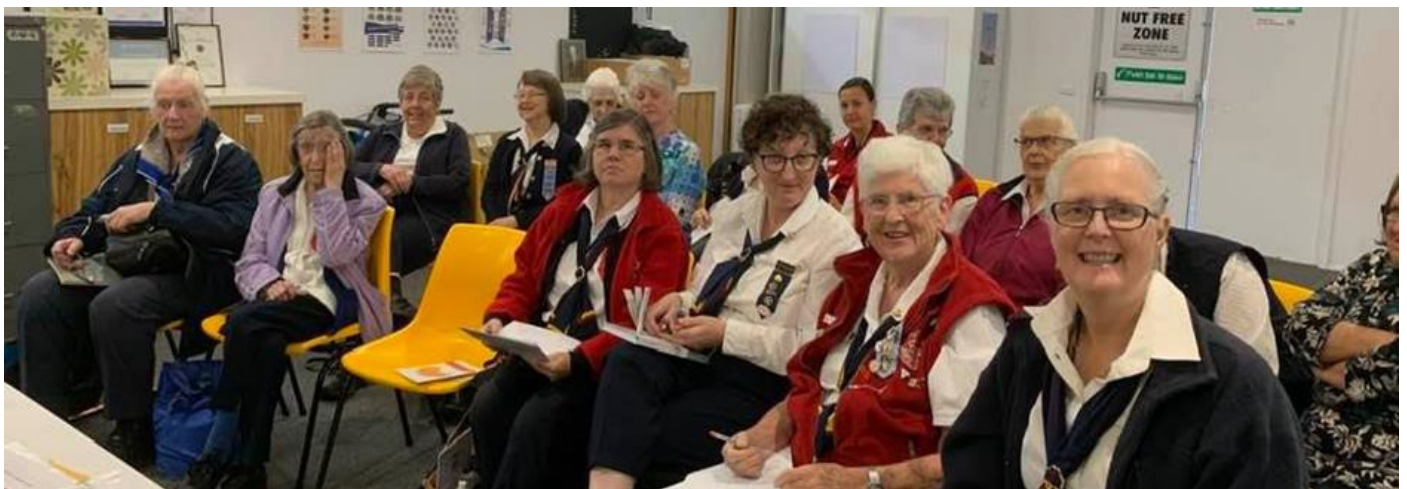
Brindabella (NSW) AGM, March 2020

I was also fortunate enough to attend four Annual General Meetings, including that of my own Trefoil Guild. It is always inspiring to hear about the numerous activities that Guilds take part in and how they support their Guiding communities as well as the wider community. Guest Speakers give enthusiastic presentations on a wide variety of topics including local charities such as the County Women’s Association and personal interest ones such as the Royal Horticultural Society.