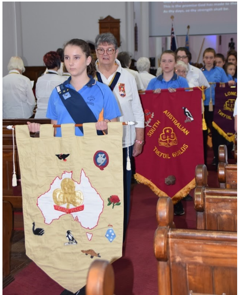
Banner parade for Thinking Day Service in St Columba's, Adelaide

Our Guiding year starts with Thinking Day and I was fortunate to attend a Thinking Day Service in St Columba's in Adelaide. Guides carried in the banners which were paced at the front of the church and a moving service was held. Afterwards, in the courtyard under the grapevine we made a toast to trefoil Guilds in this 75 th Anniversary Year. This was followed by more fellowship over lunch in the church hall. I thank all the Guild members who made this day such a memorable one and South Australia for the invitation.