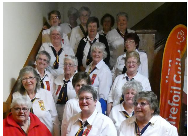
Saturday dinner at the Royal Hotel

Trefoil Guild members who helped at the Royal Adelaide Show Parcel Minding (and Biscuit sales) service this year reported that the number of parcels was again fairly low but we remain the best kept secret for those with larger trolleys to be stored during the day. Returns (several hundred dollars) contribute to the Outreach fund, as do our dried fruit and stamp sales.