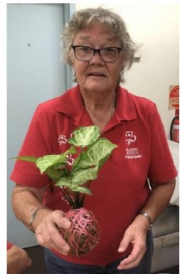
Northern Australia Trefoil Guild members making Kokedamas.

Kokedamas need to be dunked in water once or twice a week depending on where the plant is kept and they are meant to last up to a couple of years before they need to be replanted. They make a lovely gift and almost any plant can be used.