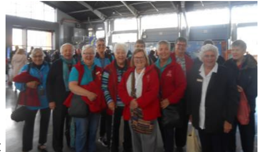
Tasmanian Trefoil Guild members greeting the travellers