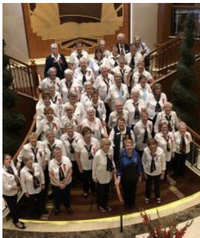
Group on Grand Staircase