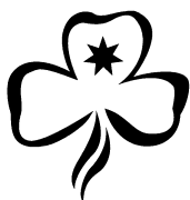
Part 1 – trefoil

The Girl Guides Australia logo is comprised of three parts. The first two parts are the trefoil and the wording. These parts are essential. The third part, the State identity, is optional and is included beneath the GUIDES AUSTRALIA wording.